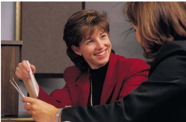
The retreat provides an opportunity to grow closer to God, have fun, relax and be inspired by speakers on various topics.