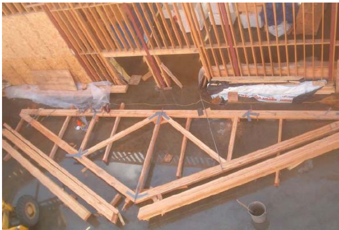
Construction of one of the main roof trusses