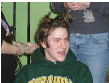
This youth shows his "outrageous hair" as part of a "personal challenge" at youth group.