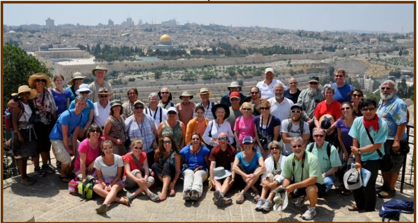
Highline Israel team with other "Jesus and His Times" class members from Jerusalem University College. This picture was taken from the Mount of Olives overlooking Temple Mount.

T he Israel Team 2012 would like to thank you for your prayers and encouragement for our recent journey, which still continues in our hearts and minds. We are humbled by God's provisions of safety and health, stability for our loved ones, as well as the blessings of a deeper knowledge of God's plan through history. Over time, we look forward to sharing with you how we have been impacted by this trip.